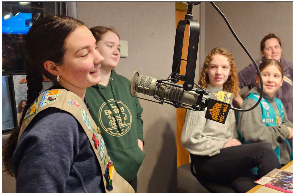
Girl Scouts of all ages stepped up to the microphone at several radio stations this spring to talk about the cookie program, shining with confidence.

just playing a rec sport, nothing wrong with sports and I think they are excellent for kids as well. But how Girl Scouts helped me find my path in life with those different experiences that just weren't local to our town. After his stubbornness wouldn't give in, I called my mom into the room and I asked without context what