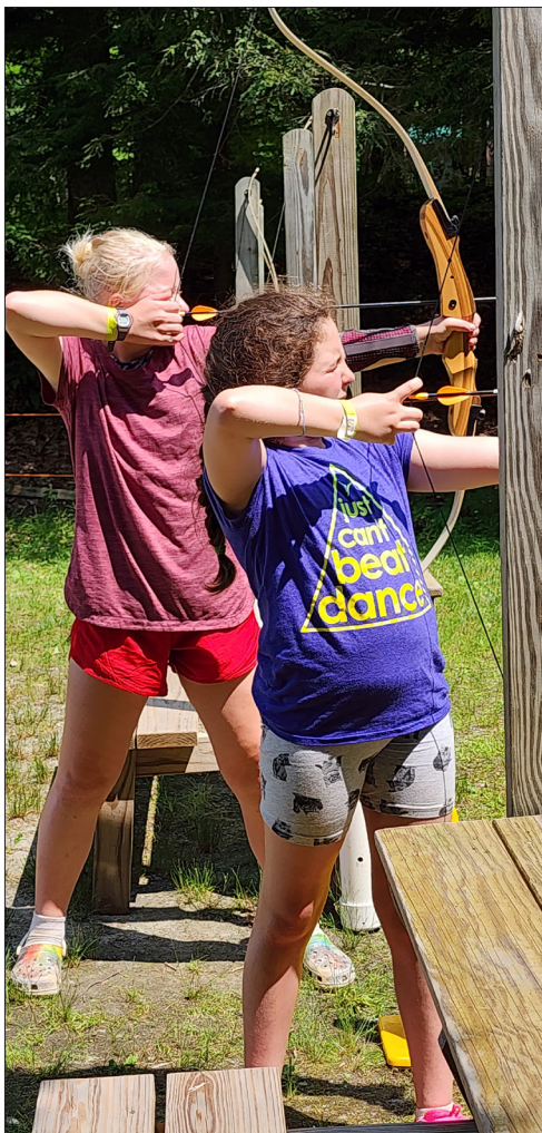
Whether shooting an arrow for the first time, conquering a climbing tower, or just spending a night away from home, the outdoors offers Girl Scouts a chance to stretch their wings.

“I would take my little sister, and we would just go door to door to door,” she said. “that translated into when I was president of my class in high school, and I always love going door to door with the calendars, or whatever it was we were selling.”