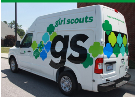
A proposed rendering of GSGWM's Mobile STEM Lab.

*Gifts made with the enclosed envelope will support the challenge.