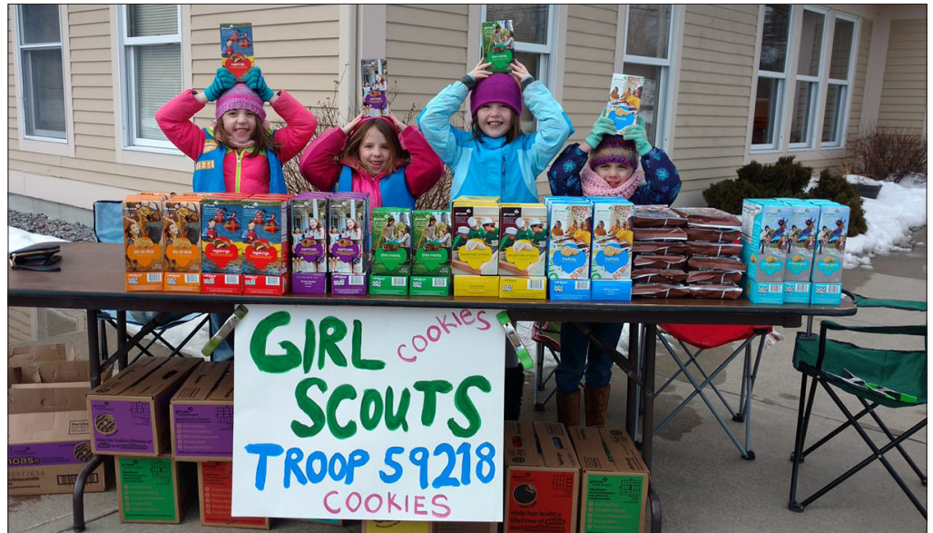
Girls from Daisy Troop 59218 in Weare, NH, show off their cookie booth.

For girls, the need for effective financial literacy programming is particularly critical, with studies showing that, while the women's labor participation rate is growing in New Hampshire and