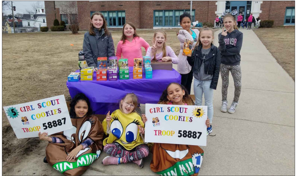
Troop 58887, from Mount Pleasant Elementary School in Nashua, NH, is one of many troops that benefit from the contributions of Citizens Bank. Here they host a cookie booth outside of their school during their meeting.

There's a gap when it comes to teaching young people the financial literacy skills they need. Many parents are uncomfortable talking about money with their children and many schools don't have time to address an "elective" topic, such as financial literacy. And even