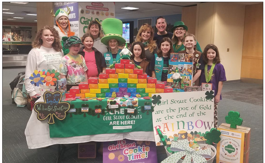
Troop 30393 of Milton, VT, show off their St. Patrick's Day-themed booth.