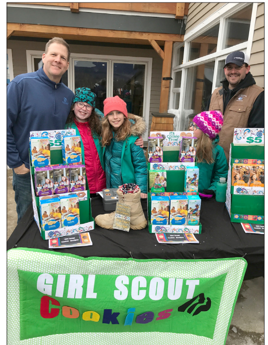
NH Governor Chris Sununu (left), stopped by Troop 59565's booth sale at Waterville Valley.

the empowering knowledge they need to be go-getters, innovators, risk-takers, and leaders in the business world and beyond.