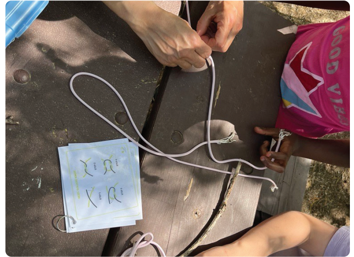
Families tied knots, canoed, and more at a special day just for families to check out summer camp.

We ran troops in partnership with after-school programs in Manchester, Nashua, Concord, and Laconia, NH, and in Brighton and Rutland, VT. Participants were mostly in grades K-5, with one troop of girls in grades 6-8 at Rundlett Middle School in Concord, NH.