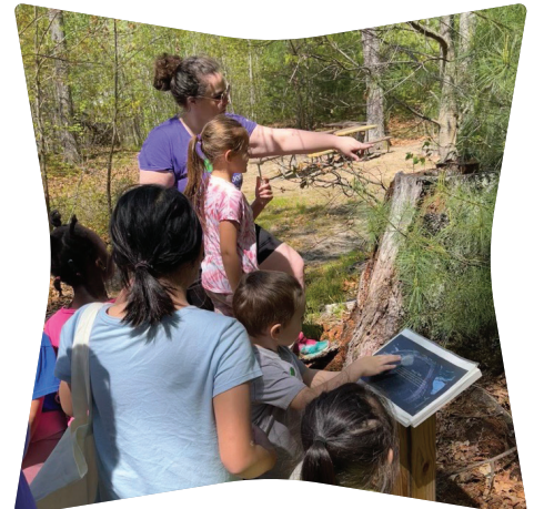
Families get a guided tour of Camp Kettleford as they hike through the nature trails.