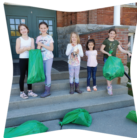
Troop 30228 helped with Green Up Day in Waterbury, VT, cleaning up two parks and a school playground.