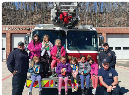
Troop 63415 donated cookies and homemade cards to Peterborough Fire and Rescue.

Our Digital Cookie platform was popular, allowing 12 percent more Girl Scouts to participate by selling cookies electronically.