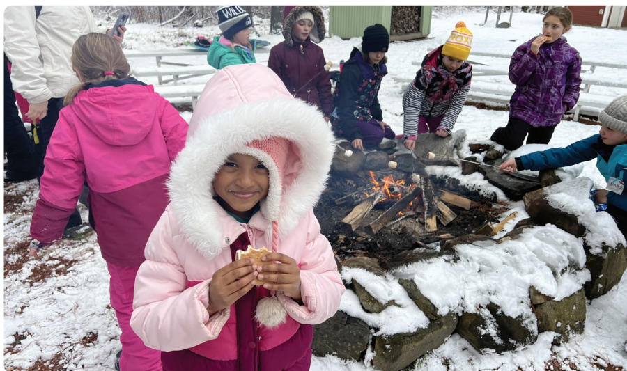
There's nothing better than hot cocoa and s'mores around a winter campfire.