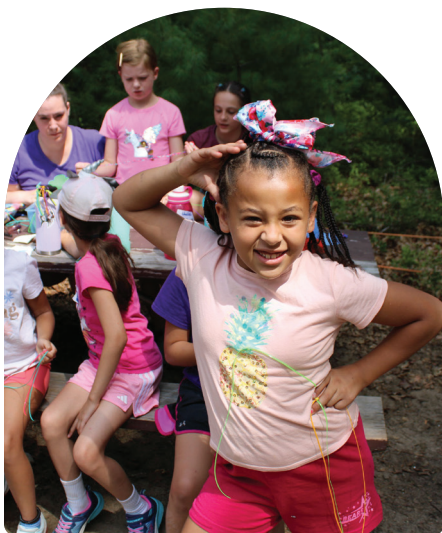
Girl Scout summer camp allows girls the chance to try new things.

Camping isn't just a summer activity! Our properties were also used by troops for winter meetings and activities, even overnight camping. Winterfest and Winterpalooza gave Girl Scouts a chance to snowshoe or sled, cook over a winter fire, enjoy a hot cocoa outdoors, and just enjoy a great day outside.