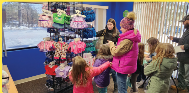
The Build-A-Bear Workshop at our Bedford Mountain Top Shop specializes in Girl Scout-themed stuffies.

The council took the Build-A-Bear experience on the road as well, allowing our membership easier access to this new retail experience. Many Girl Scout troops make a day of visiting the shop to create their own special stuffies, often using their Girl Scout Cookie Program Credits to buy the toys.