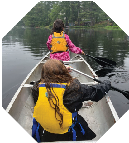
Canoing was part of the experience for families exploring camp for the first time.

financial aid awarded for girls to attend camp