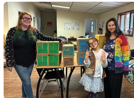
Morrisville, VT, troops donated 13 cases of cookies to the Clarina Howard Nichols Center, a women's shelter.

Because of the Girl Scout Cookie program, our Girl Scouts were able to help pay for summer camp, take field trips, cover membership and uniform costs, and fund Take Action projects. Many participated in our Gift of Caring program, which allows the public to donate cookies to our military and hometown heroes. For example, Troop 30261 of Claremont, NH, set goals to fund trips to the Mystic Aquarium in Connecticut