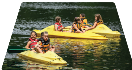
Boating is enjoyed by girls and families at Camp Kettleford.

We offered five weeks of overnight camping at Camp Farnsworth in Thetford, VT; two weeks of day camp at Camp Twin Hills in Richmond, VT; seven weeks of day camp at Camp Kettleford in Bedford, NH; and four weeks of day camp at Camp Seawood in Portsmouth, NH. Troops and families were able to camp at our properties for a weekend, making the