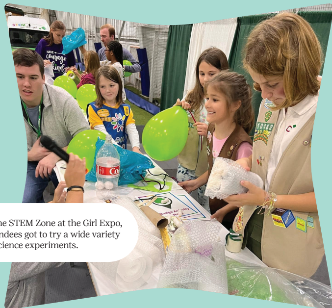
In the STEM Zone at the Girl Expo, attendees got to try a wide variety of science experiments.