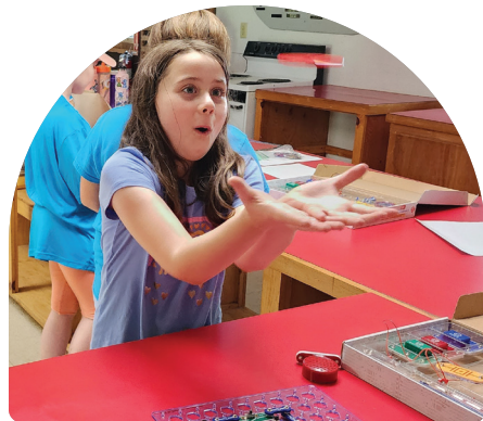
Our campers loved Snap Circuits, where they learned to complete electrical circuits that caused a piece to fly into the air!