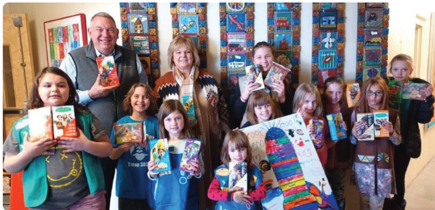
Multi-level Claremont, NH, Troop 30261 chooses a group of hometown heroes every year for a donation of cookies. This year they chose school administrators and teachers. Their cookie proceeds also paid for a trip to Savannah, GA, for the Cadettes, Seniors, and Ambassadors, and another to Mystic Aquarium in CT for Daisies, Brownies, and Juniors and their families.

packages of cookies were donated by Girl Scouts and customers to support our communities.