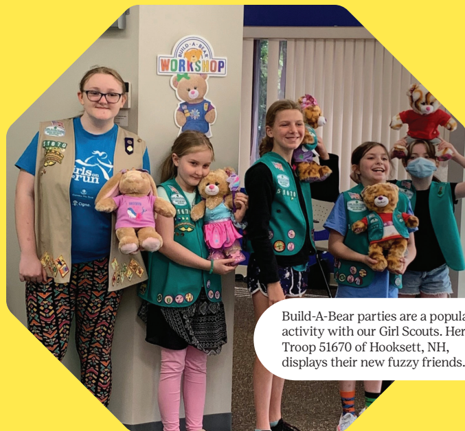
Build-A-Bear parties are a popular activity with our Girl Scouts. Here, Troop 51670 of Hooksett, NH, displays their new fuzzy friends.