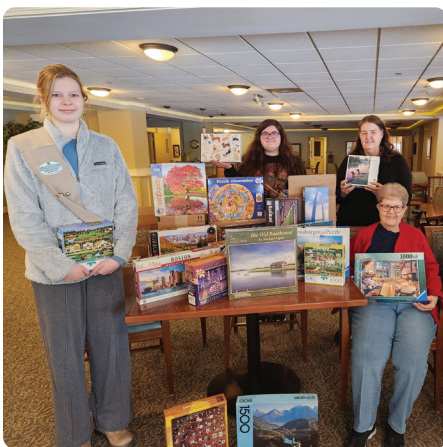
Amherst and Mont Vernon Troop 20202 collected over 100 puzzles and many memory books for seniors living in Nashua, NH.