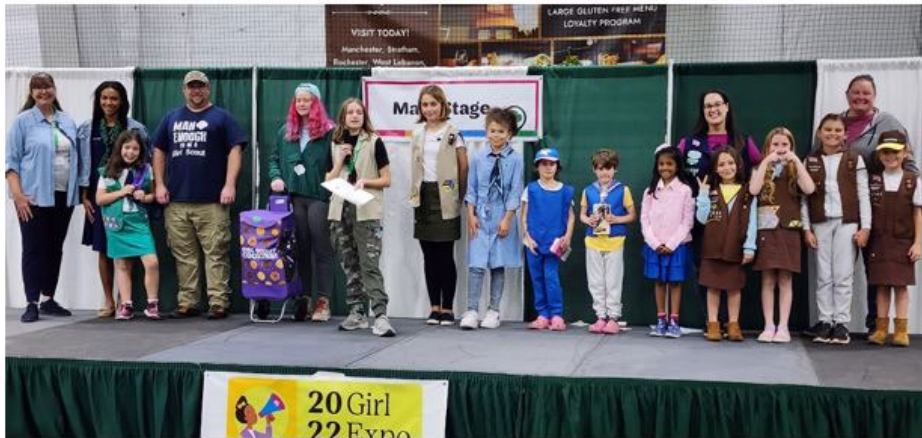
Girl Scouts and adult volunteers modeled the latest Girl Scout clothing line at the Girl Expo in Bedford on Oct. 16.