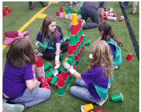
These are photos taken by a Girl Scout at the Girl Expo in 2022.