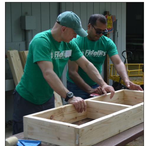
Prior to the COVID-19 pandemic, Fidelity Investments employees spent a day building benches and a garden at Camp Kettleford.