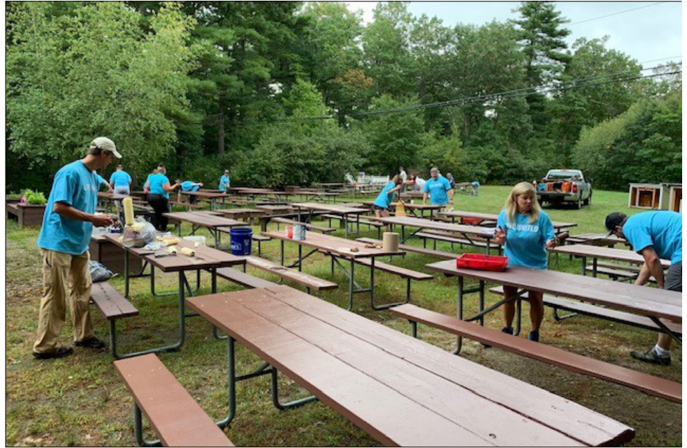
Employees of the United Way spent a day painting picnic tables and cleaning up Camp Kettleford.