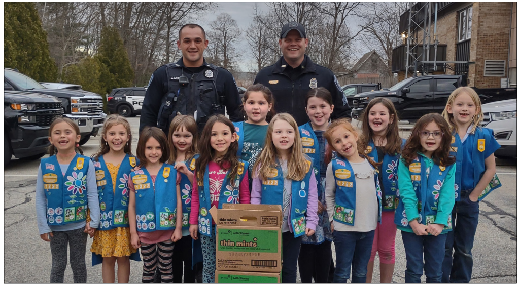
Daisy Troop 61222 of Merrimack, NH, donated 34 packages of Girl Scout Cookies as a sweet thank you to the Merrimack Police Department for being great first responders and letting them use their community room for meetings.

There are several ways Girl Scouts carry out the donations. Some troops may choose a specific organization to support.