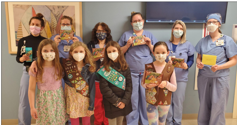
Troop 30228 of Waterbury, VT, donated cookies to health care workers.

Cookies need not even be purchased in person. Through the virtual Gift of Caring, a troop may decide to combine their donations with other troops throughout the council and contribute to our Hometown Heroes initiative, which includes those in the military, Red Cross, community groups and frontline workers.