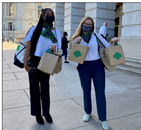
Girl Scouts of the USA staff deliver cookies to members of Congress, including Senator Jeanne Shaheen (D-NH).

Each year, Troop Capitol Hill elevates the achievements of Gold Award Girl Scouts, celebrates Girl Scout Day on March 12, and lifts up International Day of the Girl on October 11. Members of Troop Capitol Hill are also in-