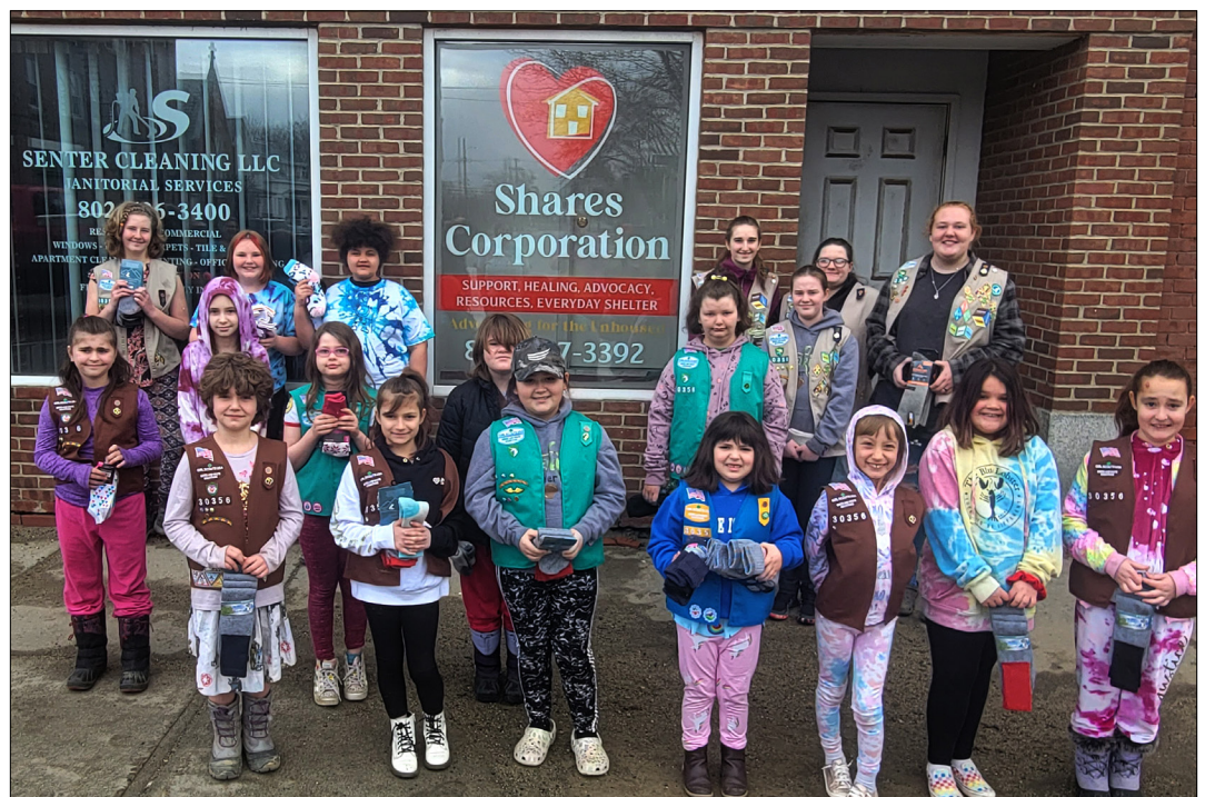
Troop 3056 of Lunenburg, VT, held a sock drive to help their community.