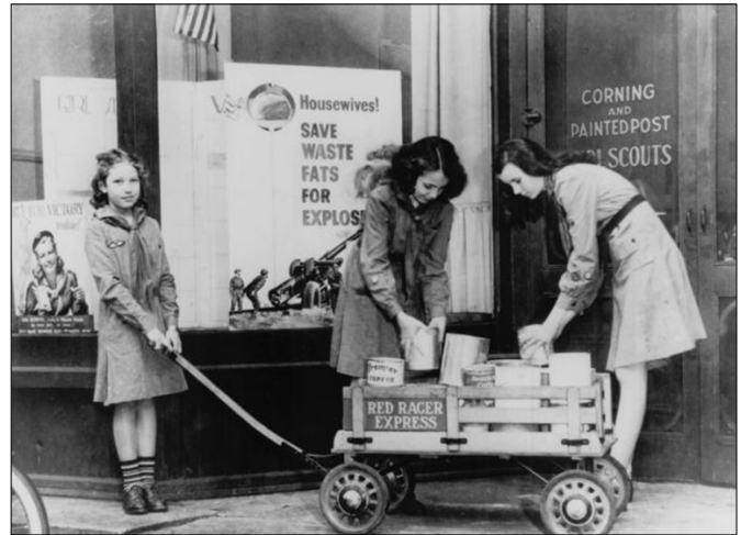
Girl Scouts collect cans in the 1940s during World War II.