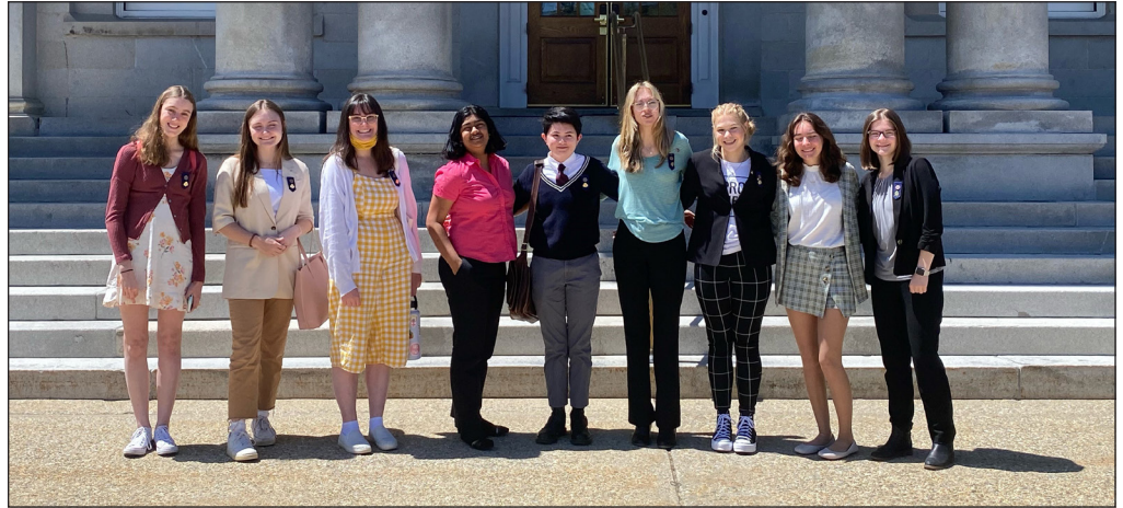
New Hampshire Girl Scouts participating in Girls Rock the Capitol meet monthly at the State House in Concord, while Vermont Girl Scouts meet at the Vermont State House for their program.

The program, unique to Girl Scouts of the Green and White Mountains, allows participants to sit in on legislative hearings and pair up with a state representative to work on a bill close to their heart. Some were already Girl Scouts, while others joined specifically to participate in the internship. The current group's interests vary widely, including women's rights, drug addiction, climate change, the minimum wage, gender equality, adoption and foster care, the economics of education, and more.