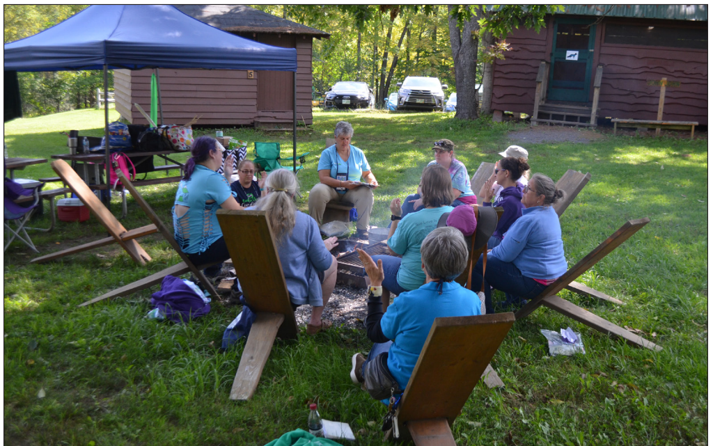
There's nothing so wonderful as Girl Scout songs around the campfire.