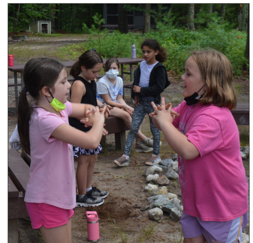
Day campers play patty cake at Camp Kettleford.