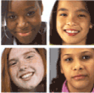
Making Friends Around the World

World Thinking Day was first created in 1926 at the fourth World Association of Girl Guides/Girl Scouts (WAGGS) International Conference, held at Girl Scouts of the USA's Camp Edith Macy (now called Edith Macy Conference Center). Conference attendees decided that there should be a special day when Girl Scouts and Girl Guides all around the world think of each other and give thanks and appreciation to their "sister" Girl Scouts. The delegates chose February 22 as the date for Thinking Day because it was the mutual birthday of Lord Baden-Powell, founder of the Boy Scout movement, and his wife Olave, who served as World Chief Guide.