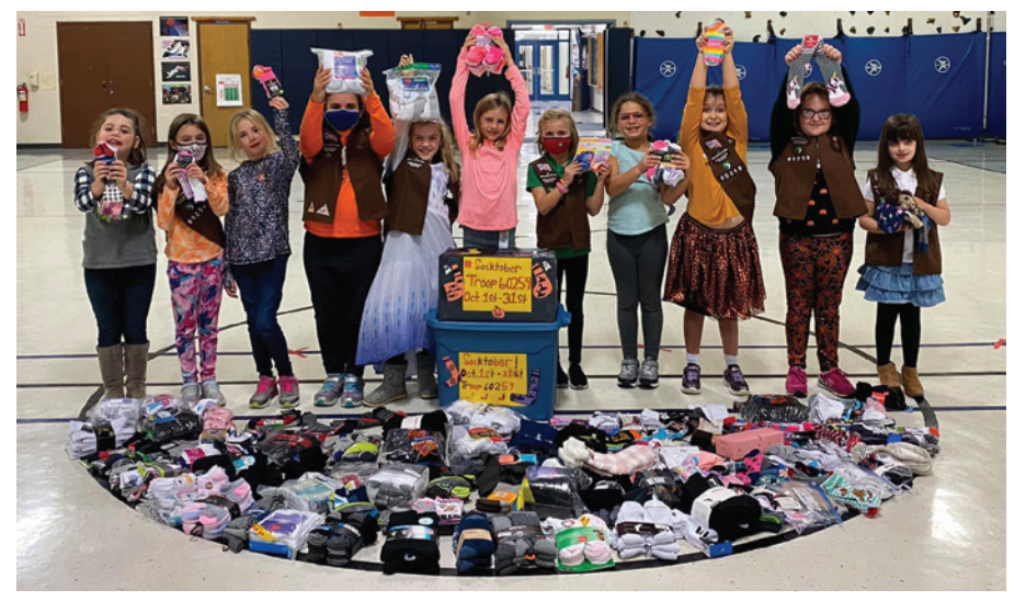
Identifying a need in their community, Troop 60259 of Londonderry, NH, put together a successful sock drive.