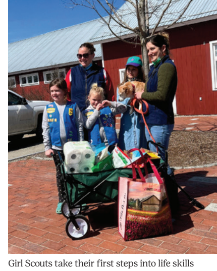
Girl Scouts take their first steps into life skills by participating in Take Action projects. These Daisies in Troop 60278 of Morristown, VT, gathered needed items for an animal shelter.