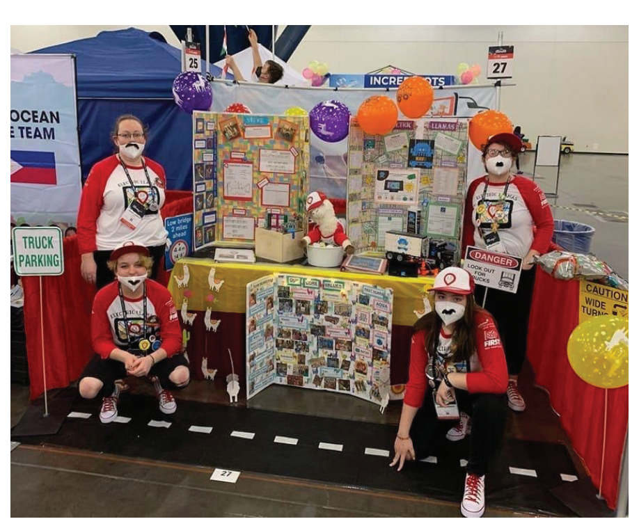
The Electric Llamas, a team of Girl Scouts long interested in robotics, went all the way to Houston, TX, to participate in the FIRST Robotics program's global championship. They impressed judges with their concept for an app that would help truckers navigate the best routes. They could not have made the trip without financial aid and the proceeds from their Girl Scout Cookie sales.

375 girls in troops run in partnership with after-school programs