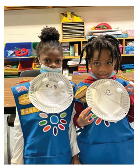
Donations and partnerships make it possible for girls everywhere to benefit from the Girl Scout Experience.

Donors of $500 or more are listed in our annual Impact Report. We make every effort to acknowledge our donors appropriately. If we have made an error, please accept our apologies and contact Customer Care. This listing reflects donations between October 1, 2021 and September 30, 2022.