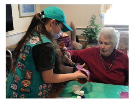
Providing service to the elderly, Bedford, NH, Troop 60053 helped the residents of an assisted living facility in making planters to brighten up their rooms for springtime. The Girl Scouts also shared stories and sang songs with the group.