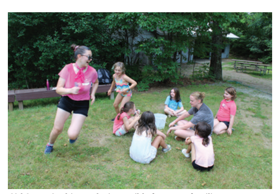
Girl Scout Cookies make it possible for many families to participate in Girl Scouting, providing the financial support needed to pay for memberships and camp.