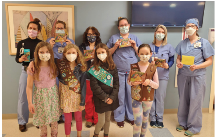
Waterbury, VT, hospital workers were grateful for the Girl Scout Cookies donated by Troop 30228. Girl Scouts learn the business and people skills so valuable in life through the Girl Scout Cookie and our Gift of Caring programs.