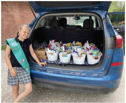
Cookies provide not just valuable life and business skills, they do good in the community. Troop 61566 in Brighton, VT, used their proceeds to made goodie baskets for local businesses and gave muffins and coffee to police and hospital workers.