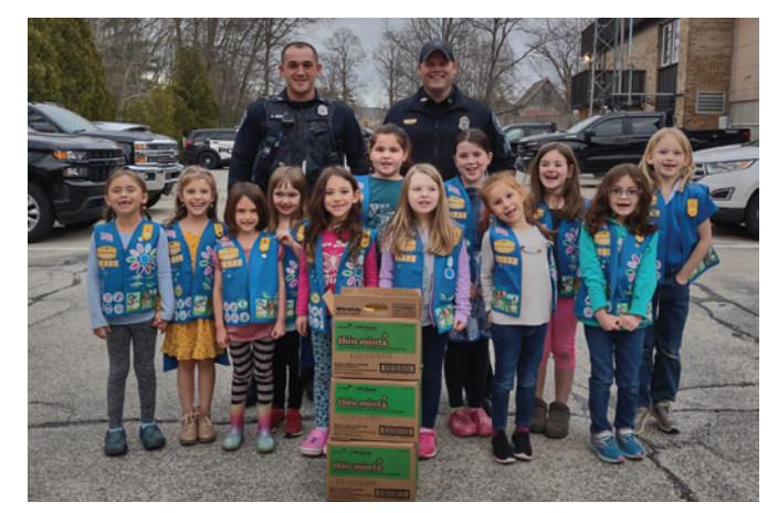
Our Gift of Caring program allows customers to donate cookies to the military, first responders, and other hometown heroes. Daisy Troop 61222 of Merrimack, NH, donated 34 boxes of cookies to their local police department.