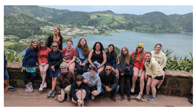
The cookie program teaches Girl Scouts how to plan, budget, and save. In addition to community service projects. Concord, NH's, "travel troops" have funded trips to the Azores, the Thousand Islands area of New York and more through the Cookie and Fall Product programs.