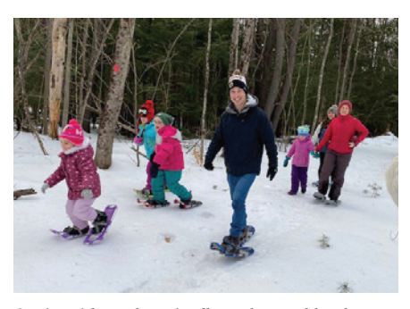
Getting girls outdoors in all weather enables them to try out new things, like snowshoeing.

324 girls and leaders camped over five summer Troop Camping weekends