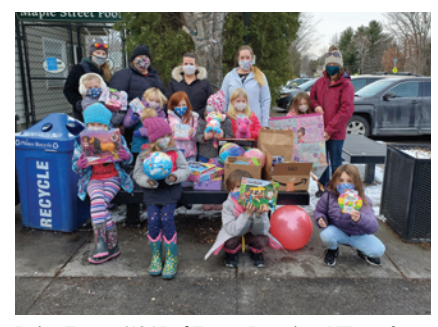
Daisy Troop 61845 of Essex Junction, VT, made sure children in their area would have presents for the holidays with their toy drive.