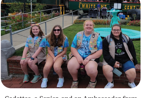
Cadettes, a Senior, and an Ambassador from Troop 30356 visited Clark's Trading Post on Scout Day, September 12.

The Girl Scouts of Troop 51442 of Danville, VT, made and displayed pinwheels with messages of peace on the Danville Green as part of Pinwheels for Peace, a worldwide project to celebrate the International Day of Peace. Pinwheels for Peace is an art and literacy project which began with two art teachers in Florida as a way for students to express their feelings about what's going on in the world and in their lives. The project has grown from 500,000 pinwheels in 2005 to over four million in locations all over the world in 2019!