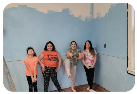
Troop 58201 of Hinsdale, NH, chose to give their clubhouse a makeover with some of their cookie proceeds.