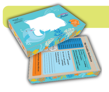
Our 2023 Cookie Rally box!