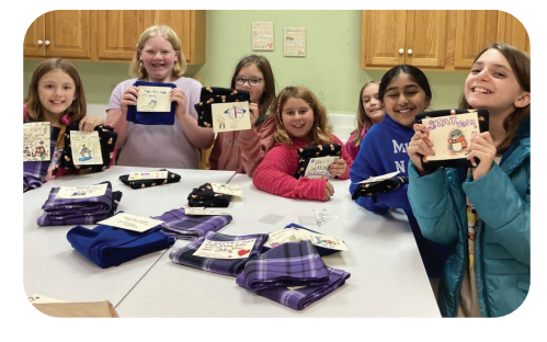
Girl Scouts in many troops in the Amherst, NH, area have created scarves with personal notes to send to Ukraine.