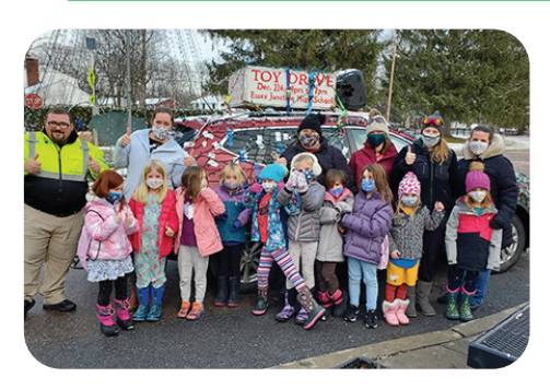
Daisy Troop 61845 of Essex Junction, VT, donated gifts to Troy's Toy Drive in Essex. They also completed their Toy Designer badge as part of their December activities.