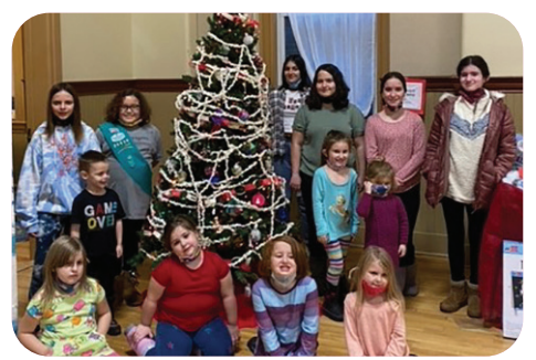
Troop 30456 in St. Albans, VT, decorated a tree for the Festival of Trees, even making the ornaments.