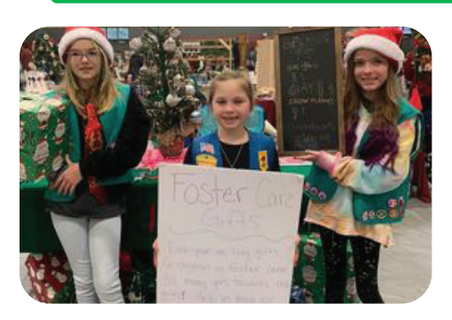
Troop 60180 from Loudon, NH, sold handmade ornaments and made enough money to buy gifts for 21 kids in foster care for this holiday season.