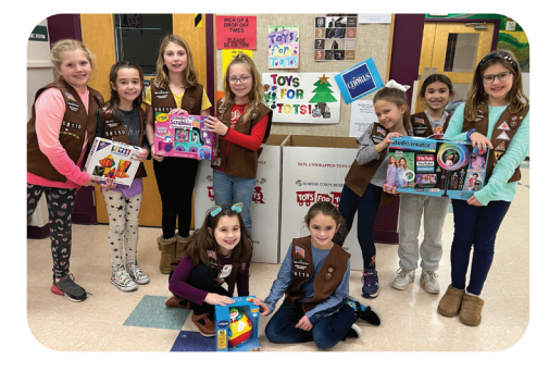
Troop 58110 of Bedford, NH, used proceeds from a holiday craft fair to purchase toys for the toy drive at their elementary school.