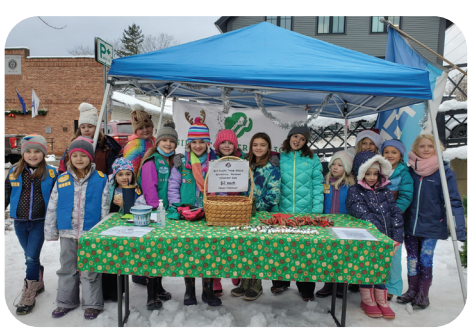
Troop 30228 of Waterbury, VT, participated in the Reindeer Rendezvous, selling ornaments to raise funds to help a children's hospital and animal shelter.