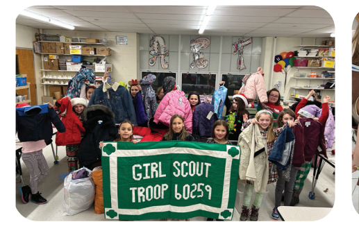
Troop 60259 of Londonderry, NH, kept their drumbeat of giving alive. They donated over 100 coats and new clean socks to two local organizations to help those in need!

Send photos with description to Customer Care at customercare@girlscoutsgwm.org. Be sure to put Troop Spotlight in the subject line.