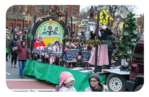
Service Unit 223 worked tirelessly to get their "1950s Rockin' Around the Christmas Tree" float ready for a parade in Rochester, NH, and it paid off - they were the People's Choice for 2022 and took home a plaque and bragging rights!

Saturday, April 1 –With a special visit from Build-A-Bear! 10:00 a.m. – 4:00 p.m.