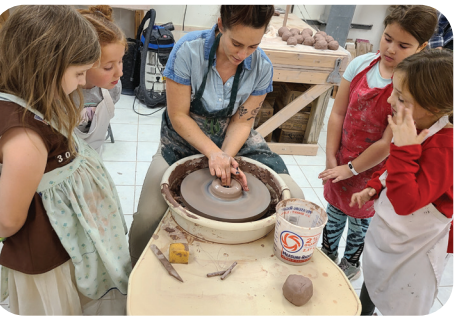
The Brownies of Troop 30456 of St. Albans, VT, had a great time earning their Pottery badge. Both the girls and adults got to try out the wheel and had a great time.