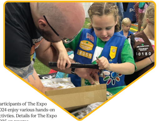
Participants of The Expo 2024 enjoy various hands-on activities. Details for The Expo 2025 on reverse.